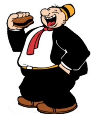
"Hungry Old Men Involved in Eating Sessions"