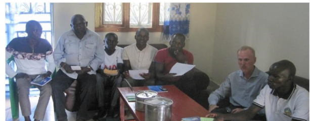
Prison ministry team preparing Bible study material for sharing in the prison. Afterward we break our prayer and fasting with a common meal.

We returned to the prison for ministry in August 2022. We resumed ministry in faith that God would use us to deliver his message, and that his message would be received. Attendance by the prisoners reached numbers previously unimagined by me, 32% of the prison population. A friend who, years ago, spent four days in prison told me how important it is to the prisoners that a ministry team visits them faithfully. We endeavor to do that.